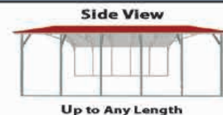
Up to Any Length

End to End 26' - 30' Wide $150.00 Side to Side 21' Long $100.00 Each Additional 5' Add $25.00